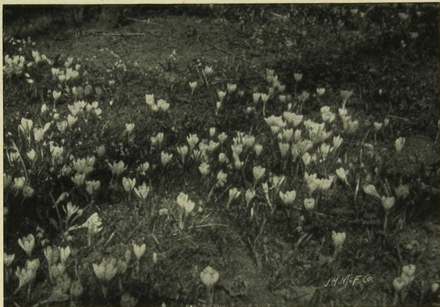
A Planting of Crocuses